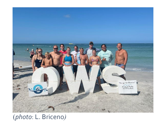
Waters of the Atlantic