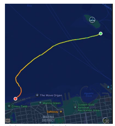
Phil's swim track

She swore that was no problem. She was too frightened of being swept out to sea alone. At least with me she'd have company. The boat got into position, and the captain asked us to jump, one by one, starting from the lowest (slowest) swimmer and working up. After the first 30 or so people had jumped, the jumping platform was empty, as everyone was staring at everyone else to see who was brave enough to be next. The crewman yelled "Come on! Who's next?"