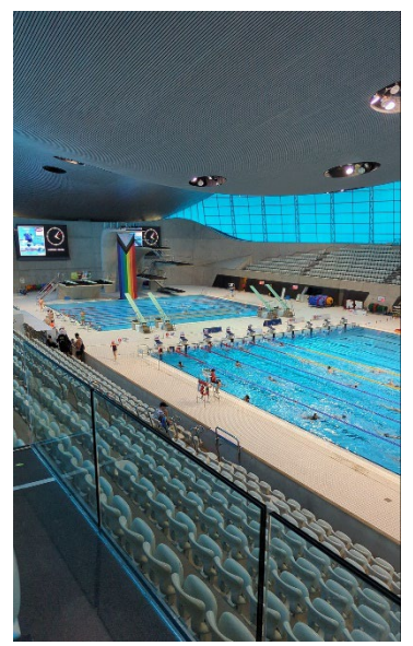
London Aquatic Center