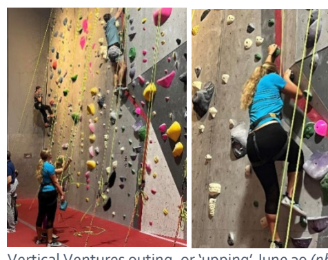
Vertical Ventures outing, or 'upping' June 30 (photo:

the Grand Central and Edge Districts or challenging oneself to great heights at Vertical Ventures. This group is always up for some healthy competition.