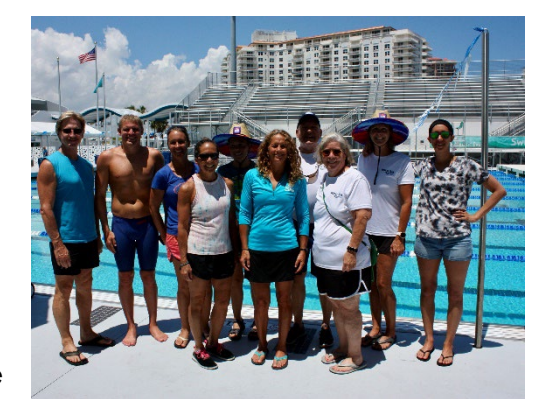
SPMers on deck

Congratulations to the 2023 YMCA Nationals. I always knew combining SPM with my long-time friends (some since childhood) from the Westport YMCA in Connecticut would make us a pretty formidable team. We totally dominated Masters YMCA Nationals which returned to the International Swimming Hall of Fame (ISHOF) pool in Fort Lauderdale, FL this past April. We won the Women's, Men's and Combined Titles quite convincingly and we're