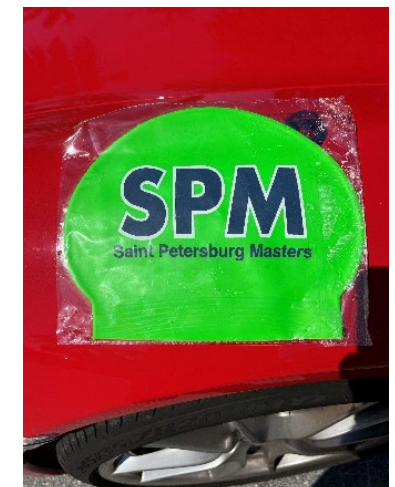
New swim caps!